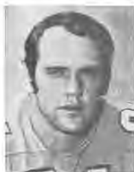
B E I R N E