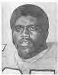
B E T H E A