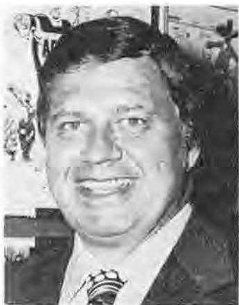
K. S. "Bud" ADAMS, JR. Owner-President

Kenneth Stanley Adams, Jr. was one of the conceivers and founders of the American Football League, and his Houston Oilers were organized in 1959 as a charter member of that group.